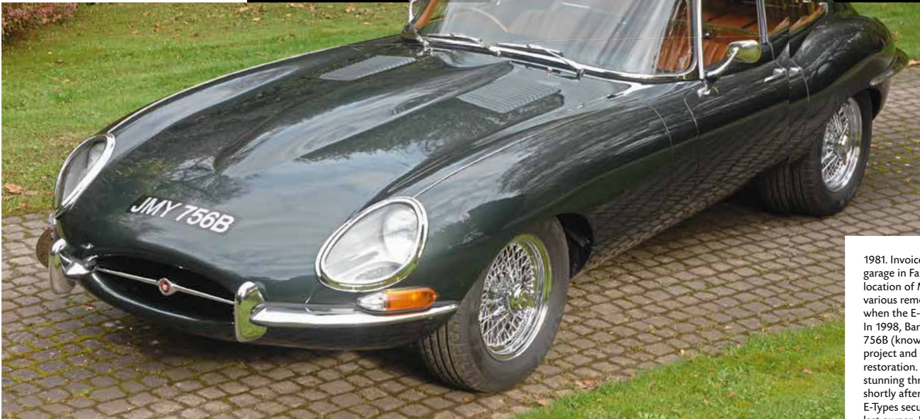
OPPOSITE PAGE L-R: Powerful Eagle 4.2-litre engine packs a real punch