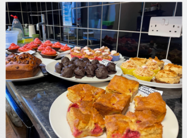
Valentine's cake bake sale 2022

All money raised by the committee is matched by Skerritts.