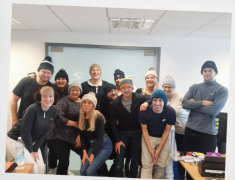
Woolly Hat Day 2022