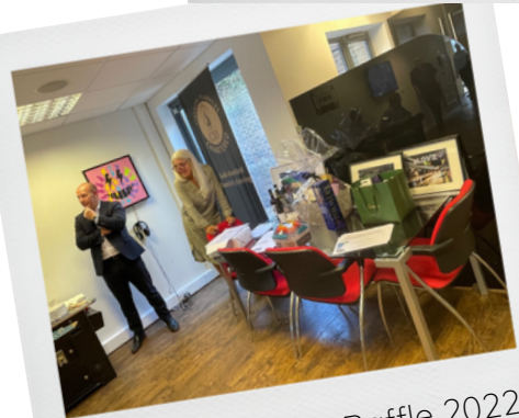
Skerritts Charity Raffle 2022