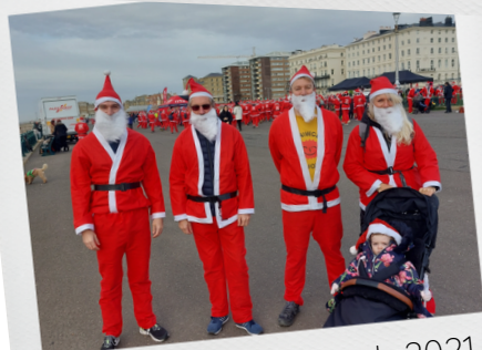
Brighton Santa Dash 2021