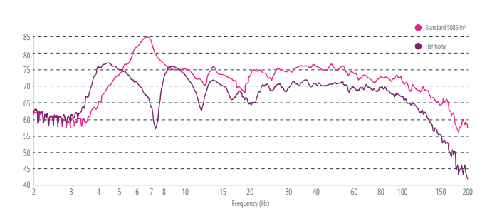
Shot gather spectra from a permanent reservoir monitoring system showing a 10 dB uplift at 4Hz, 5085cuin (pink), Harmony (purple)