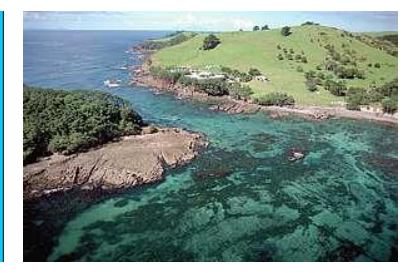
Day 5 Breakfast & dinner included; lunch on own

Today we'll have a day excursion to Tiritiri Matango Island with a focus on wildlife diversity and management. Later in the evening we'll return to our hotel for dinner.