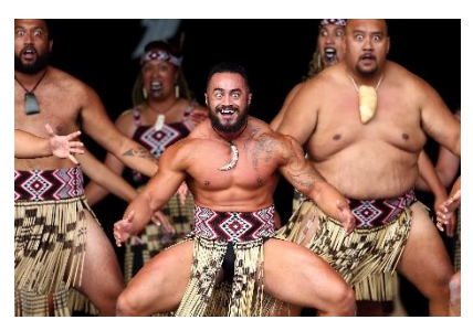
Day 8 Breakfast & dinner included; lunch on own

Today focuses on tectonic processes, tourism and the incredible Maori culture!