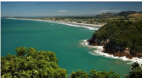
Day 7 Breakfast & dinner included; lunch on own

Today we'll visit the Taupo Volcanic Zone. This zone, running from the north-east coast to the center of the North Island, is where New Zealand's most active volcanoes are found because it overlies the subduction zone where the Pacific tectonic plate is being forced beneath the Australian plate. The Maori people who still live in this area were originally drawn here by the benefits of the hot springs and mud pools. In the evening, we'll return to Rotorua.