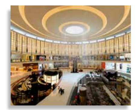
The Dubai Mall, Dubai, UAE