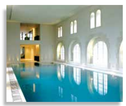
Stanley House, London, UK