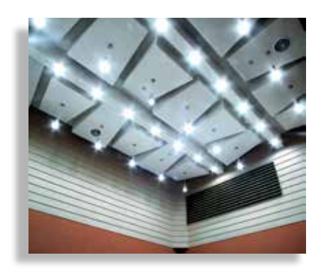
KBS Dubbing Room, Seoul, Soth Korea

The Terraco Group is committed to an extensive Research & Development Program. The Technical Centre, based in Ireland, leads the Group's in-house product development program and is responsible for making sure that Terraco products remain at the forefront of their field with regard to innovation, quality and environmental standards. Terraco cooperates with several technology partners and suppliers, conducting joint research projects in common interest areas.