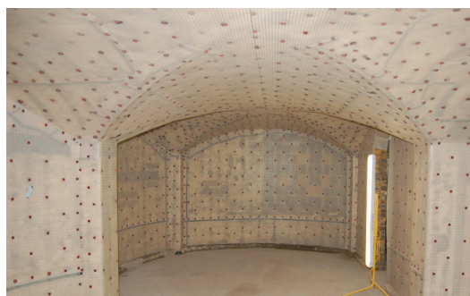
Newton 508 Mesh installation complete, ready to receive direct plaster finish