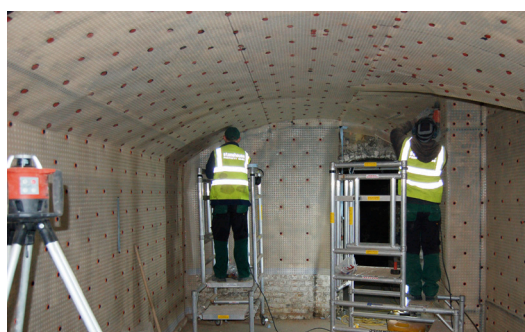
Newton 508 Mesh being expertly installed to the vaulted areas by Stonehouse Basements