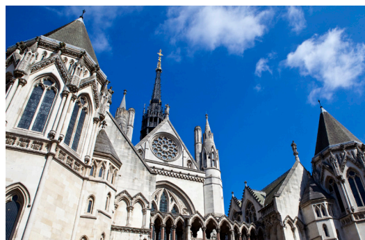
The Royal Courts of Justice, a prestigious Grade I Listed Building