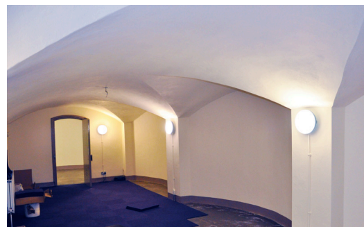
Structural waterproofing work completed. The Judges' Robe Rooms are ready for business