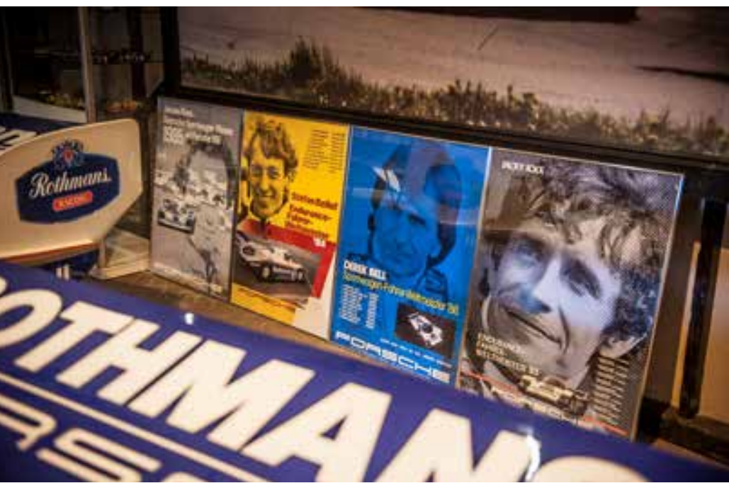
Models, posters... there is a place for all sorts of fascinating ephemera in the Historic Porsche Collection.