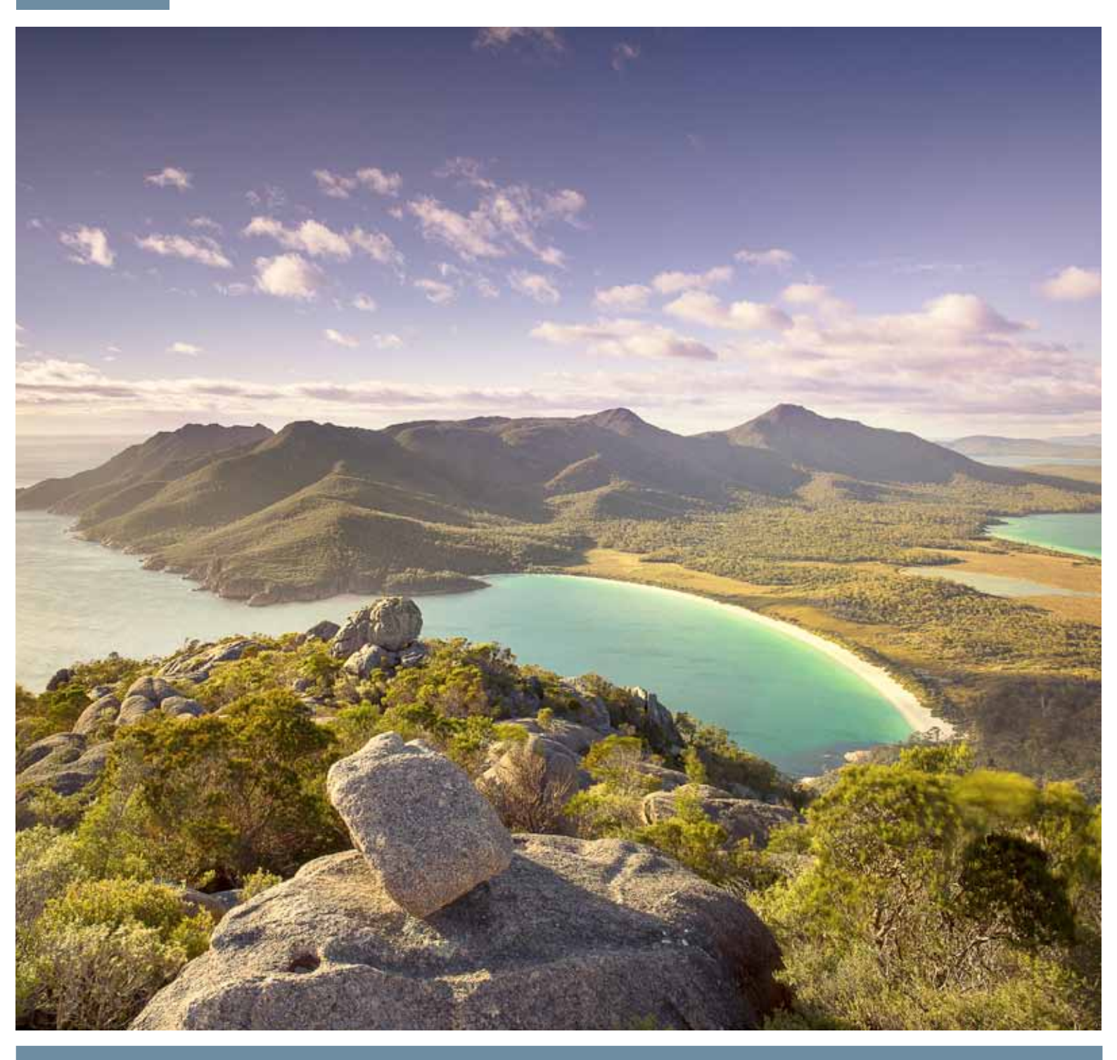
Day 3 Freycinet – Wineglass Bay

From the urban environs of Hobart today you will travel to the beautiful east coast and the pink granite mountains and powder-soft white beaches of the Freycinet Peninsula. There's an interpretive guided walk to world-famous Wineglass Bay, where the photography opportunities are endless.