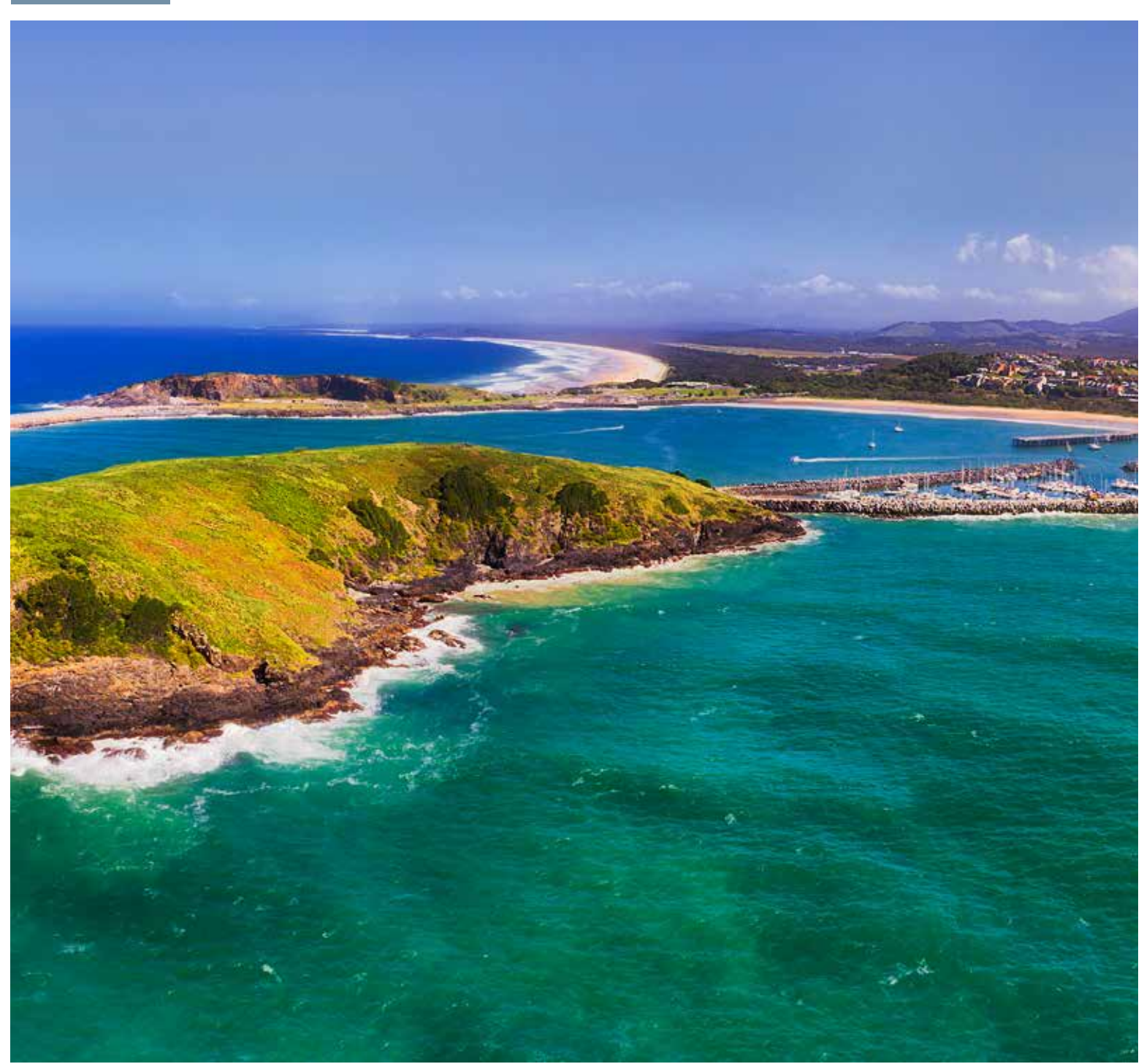
Day 1 Brisbane & Coffs Harbour

After setting off from Brisbane, enjoy lunch on board and a relaxing afternoon settling in to your private cabin before arriving at the coastal town of Coffs Harbour. As the sun dips beneath the horizon, enjoy a unique beachside dinner where you'll feast on local produce and fresh seafood matched with fine wines, while the waves lap at the shore nearby. After a few leisurely hours, you'll reboard the train and set off for the night.