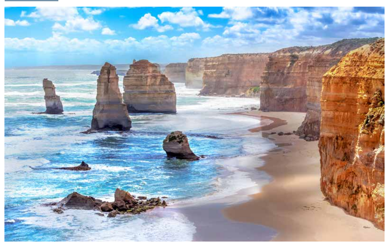
Day 3 Melbourne, Great Ocean Road or the Moorabool Valley & Geelong

After breakfast on board choose how to explore Victoria. Discover the bustling city of Melbourne, take a road trip to the Great Ocean Road or spend a relaxed afternoon in the Moorabool Valley and Geelong Waterfront.