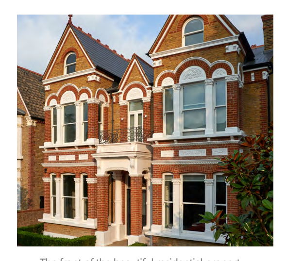
The front of the beautiful residential property.

Stonehouse are one of Newton's oldest and most experienced specialist contractors, and they showed their expertise here by delivering a dry, safe basement for the client that could then be transformed into a beautiful new part of their home. Furthermore, the installation was backed by Stonehouse's 10-year quarantee, for complete peace of mind.