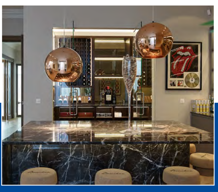
The luxury basement was finished to an extremely high standard.