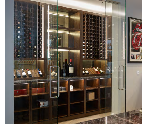
The high-end basement included its own wine cellar.