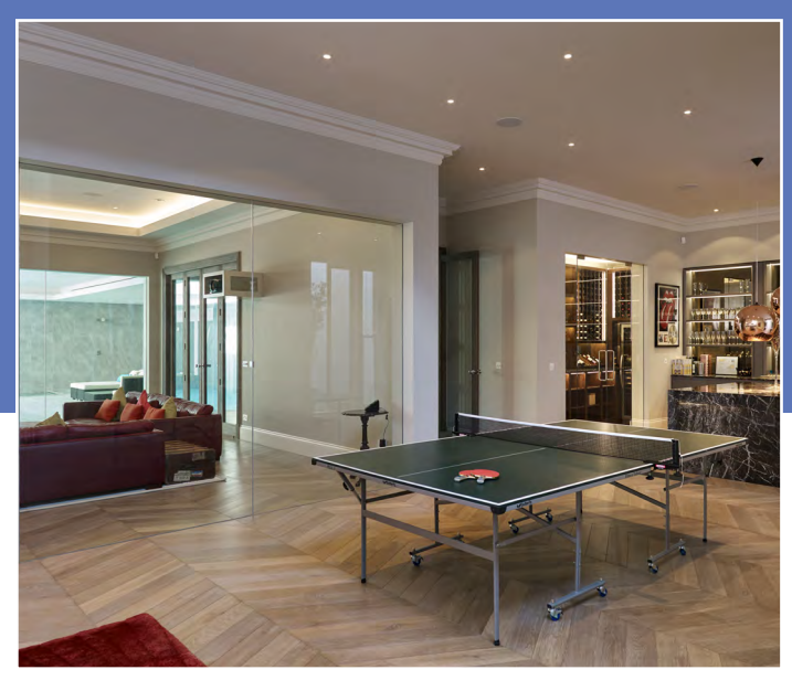
The largest basement area also has a living room and games room.