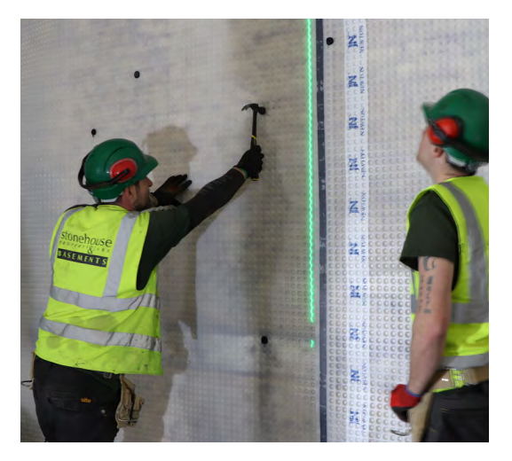
Stonehouse are experienced waterproofing installers.

Stonehouse completed an extremely complex and detailed cavity drain installation with precision, resulting in an exceptionally neat waterproofing system, and proving the benefits of using a specialist waterproofing contractor.