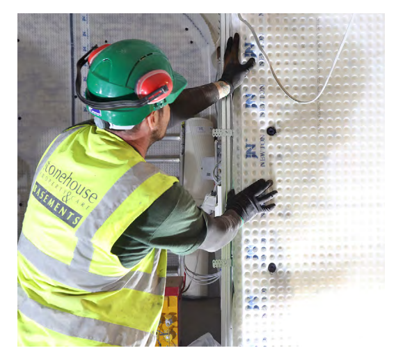
Careful detailing was required in the tricky space.