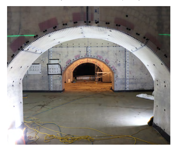
The network of vaults extends a long way beneath the streets of London.