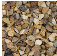
Corn Flint 6-10mm