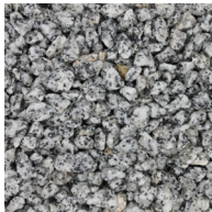
Silver Grey Granite 1-3mm, 2-5mm