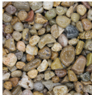
Trent Pea 6-10mm