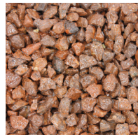
Nat.Red Granite 1-3mm, 2-5mm