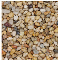
Dorset Gold 6-10mm