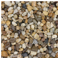
Rhine Gold 6-10mm