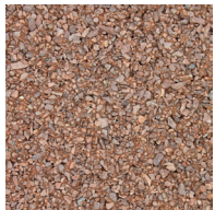
Nat. Red Granite 2-5mm