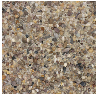
Trent Pea 3-6mm