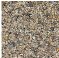
Brittany Bronze 1-3mm, 2-5mm