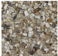
Corn Flint 2-5mm