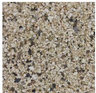
Chinese Bauxite Footgrade, 1-3mm

A range of natural aggregate colours are available to suit most project needs.