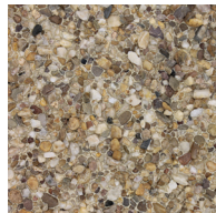
New Rhine Gold 2-5mm