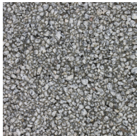
Silver Grey Granite 1-3mm, 2-5mm