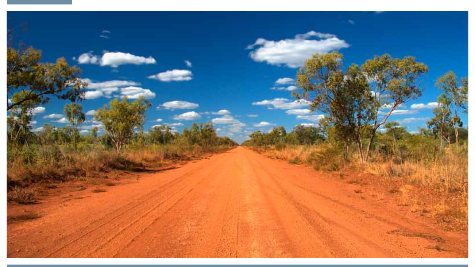
Days 6-7 Kakadu National Park & Arnhem Land

You'll be collected early this morning for your Kakadu and Arnhem Land experience. Highlights include a guided walk at Nourlangie Rock, a cruise on the Yellow Water Billabong and a 4WD adventure into Arnhem Land.